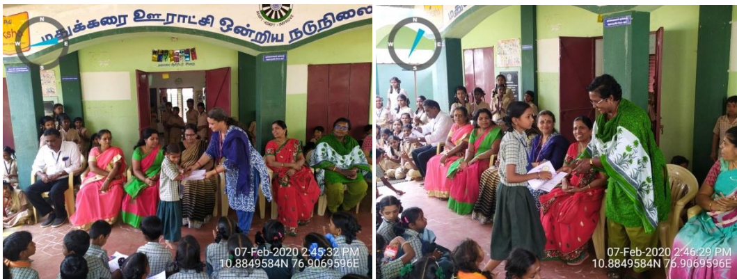
Figure 16: Prize Distribution

In the afternoon session we distributed certificates for the winners of the activities conducted during the previous days of camp.