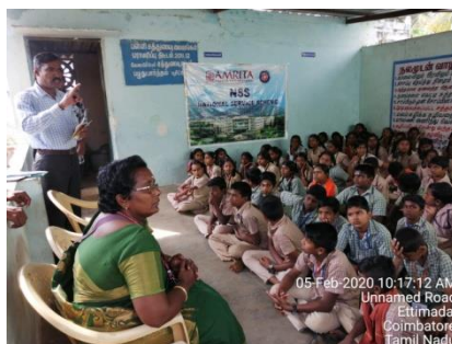
Figure 10: Postal awareness