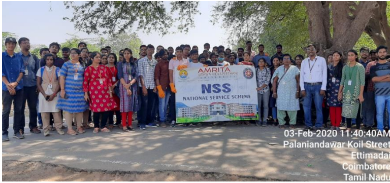
Figure 3: The NSS team