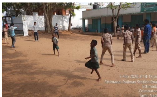
Figure 11: Sports event

We taught them DRAWING, LOGICAL PUZZLES, MATHEMATICAL TRICKS, etc. The students were eager in learning with us and they enjoyed the session. After the students had had their lunch we conducted outdoor activities. Students were energetic and they participated actively.