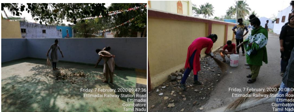
Figure 15: Cleaning in and around the School.

We started the work at Ettimadai high school with a prayer. We cleaned the area in and around the school. There are four temples near the school and we cleaned them. We did the pre-painting work like scratching, puddling in the school.