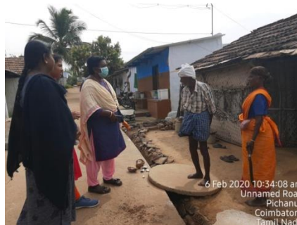
Figure 13: Awareness on cleanliness ,tobacco