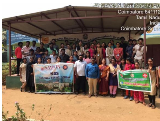
Figure 14: ILL EFFECTS OF TOBACCO

The speech was delivered to students of class 7 & 8 where he told that tobacco causes cancer, stroke, asthma, chronic lung disease, etc. Then we cleaned the temple. Few students cleaned the road while others weeded the area around the school.