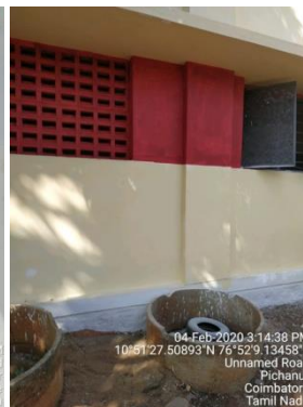
Figure 5: Amalabaratham