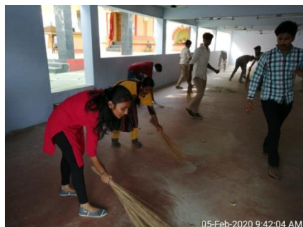
Figure 9: Cleaning the hall

various schemes available in post office such as SIRU SEMIPU KANAKU, SELVAMAGAL SEMIPU THITAM, PUBLIC PROVIDENT FUND, RECCURING DEPOSIT & PROFITABLE SCHEMES for senior citizens. He encouraged the students to start saving wisely. He spoke about the advantages of Postal scheme over bank. He also told about the available insurance services. Then we cleaned the school tank and the school ground. We split into groups where each group interacted with the students of each class.