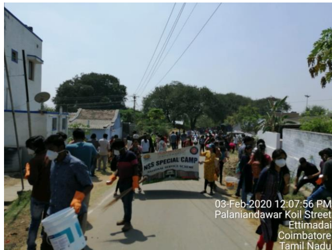
Figure 2: During the cleaning process