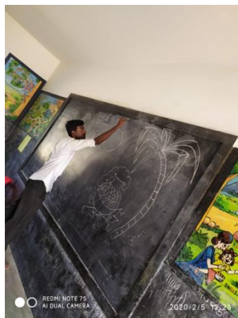
Figure 12: Engaged students with activities