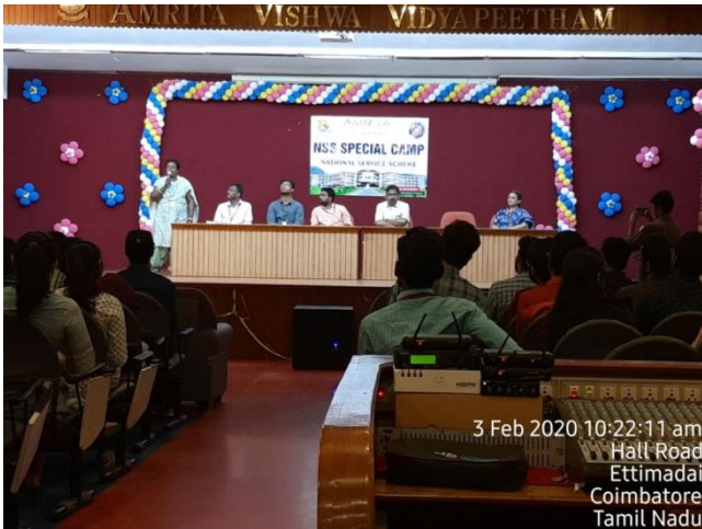
Figure 1: Inauguration program at AMRITESHWARI HALL