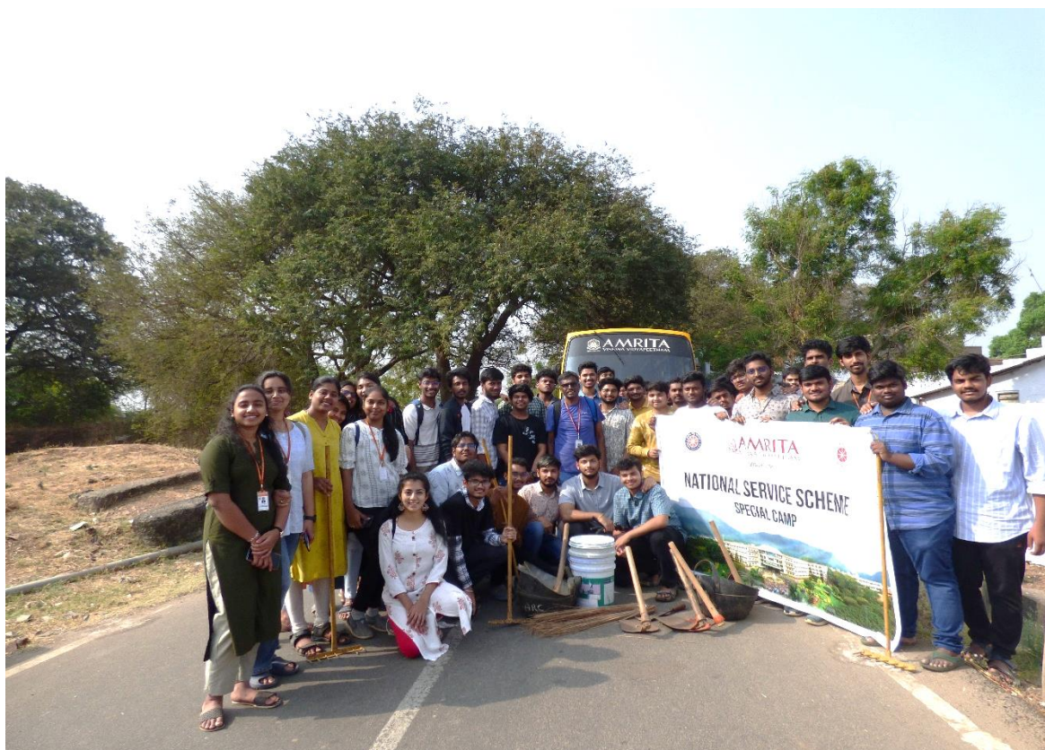
NSS volunteers preparing for the awareness and survey.