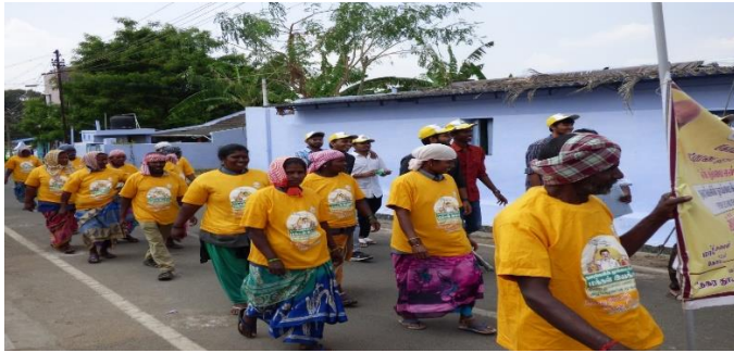
Other Panchayat staff during the rally.