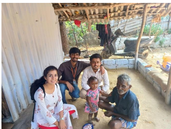
Awareness about the ill effects of child marriage was given.

The residents were asked to help the birds with food and water during the hot summers.