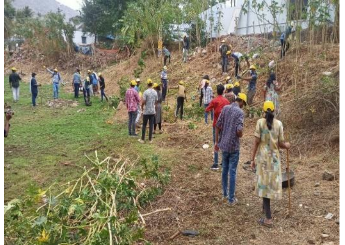
NSS volunteer team for pond cleaning