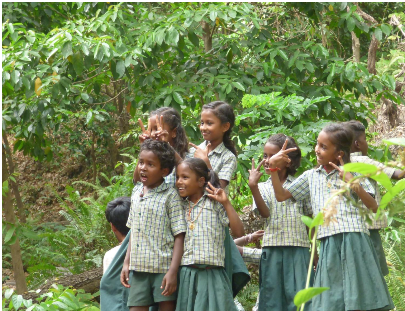
Kids of Government Tribal Residential school of Chinnampathy.