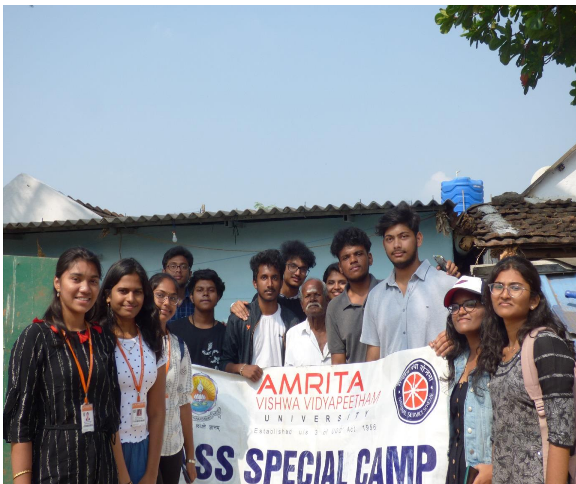
NSS volunteers with the village head.