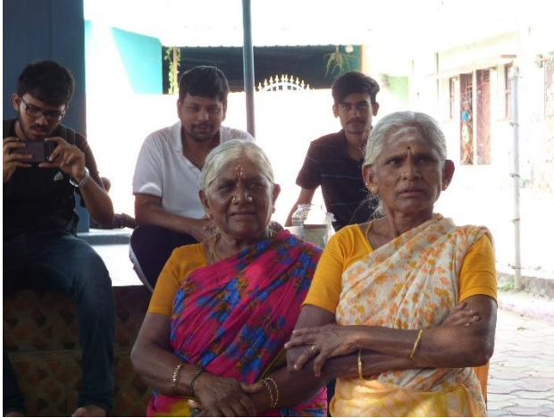
Elderly citizens gave their input for the awareness program.