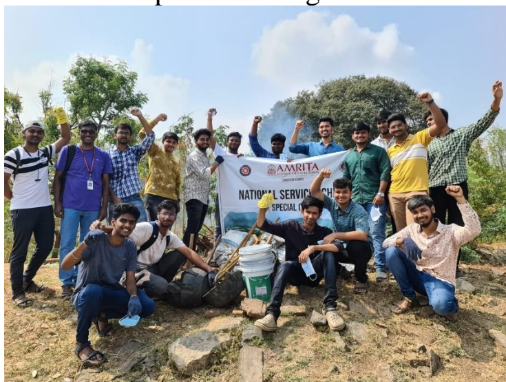
The pond cleaning team

The waste was transported for proper segregation and follow-up treatments.