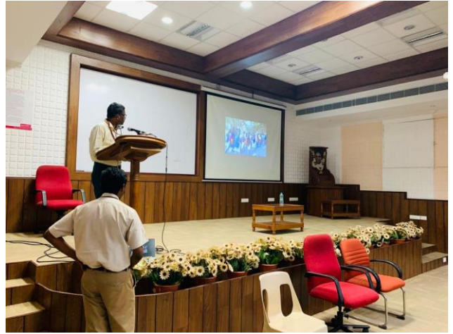
Program Officers give instructions and necessary details about the camp.