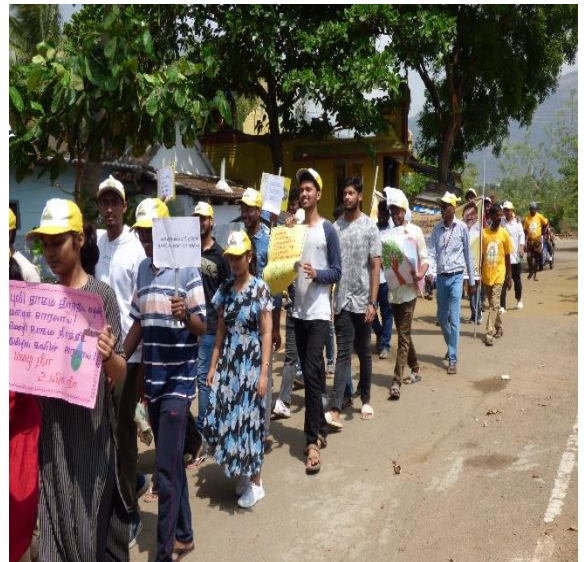
NSS volunteers on a rally to increase the awareness of Swachh Bharat