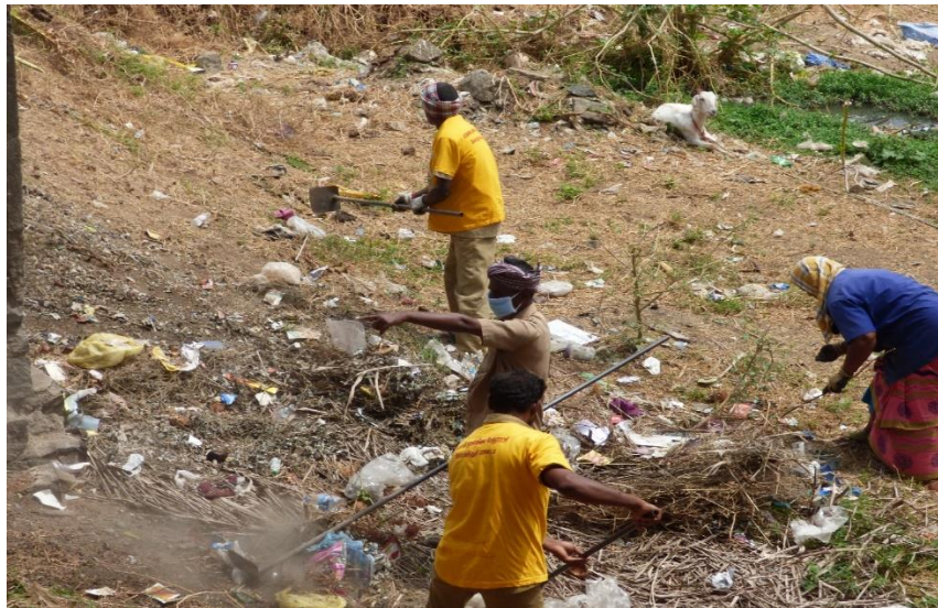
The condition of the pond when the cleaning just began.