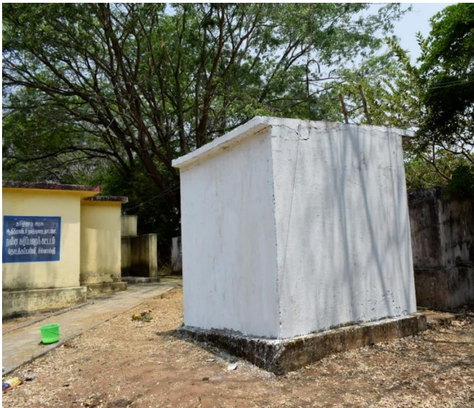
Before, during, and after the whitewashing of the school motor room.