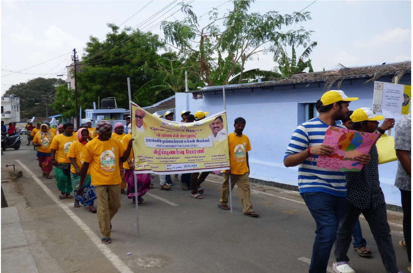
Rally along with the Ettimadai Panchayat Officials.