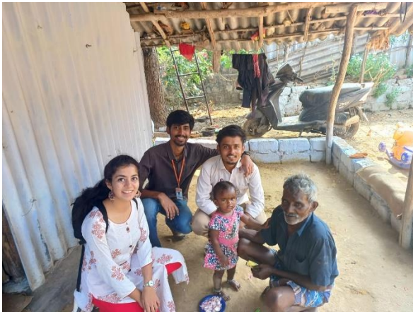
Awareness about the ill effects of child marriage was given.

The residents were asked to help the birds with food and water during the hot summers.