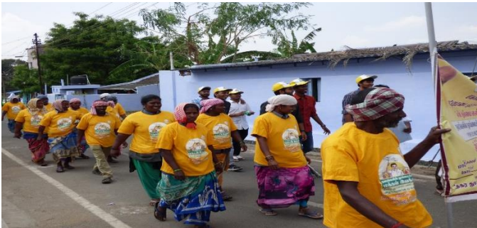
Other Panchayat staff during the rally.

With the guidance and support of the Panchayat staff, the pond cleaning session continued. By the end of the day, several other parts of the pond had been cleared of all sorts of waste, including plastics and other non-biodegradable materials. Additionally, many weeds were cut down. The volunteers were motivated by the idea that small changes can make a big difference.