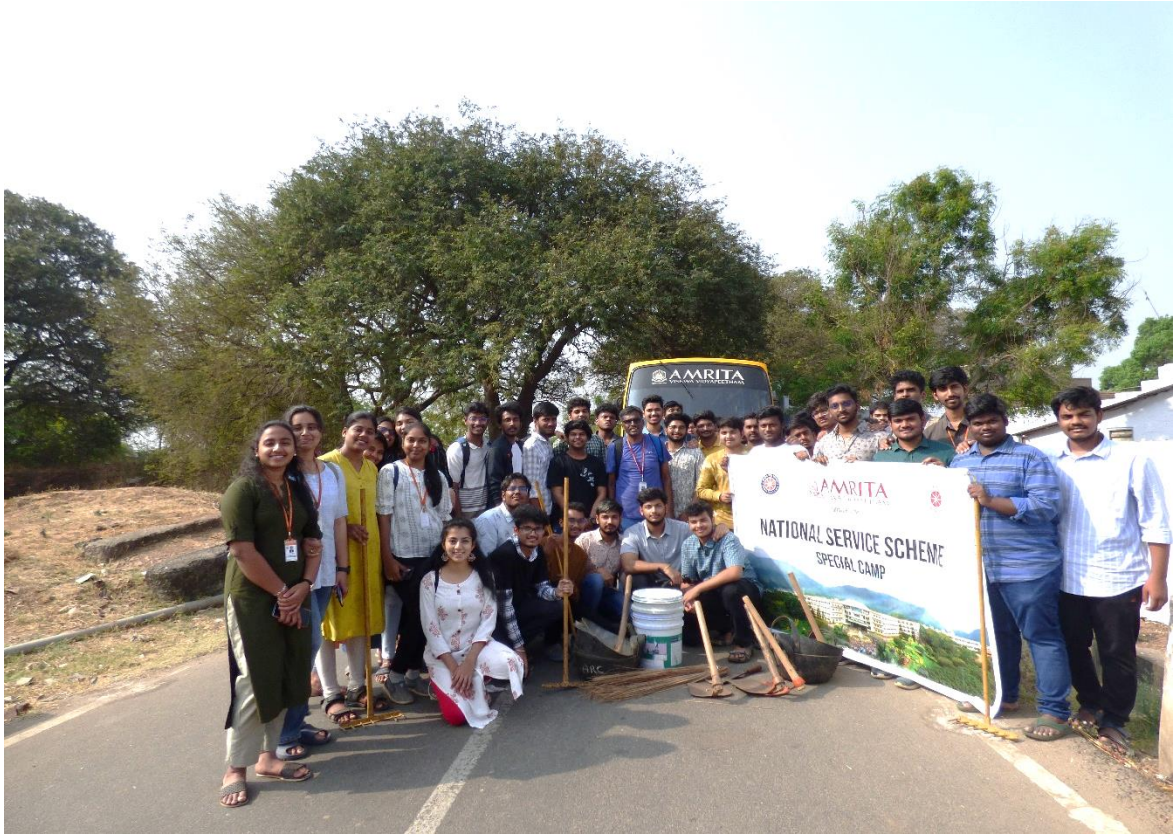
NSS volunteers preparing for the awareness and survey.