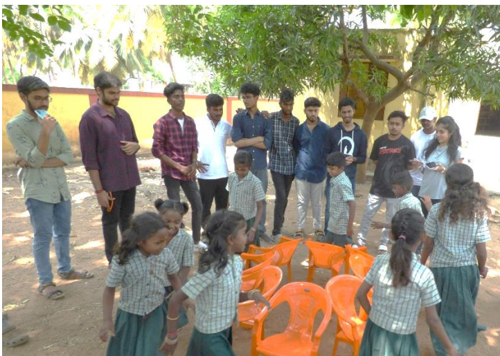
Kids played musical chairs game with extreme happiness and concentration.