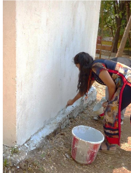
Last level whitewashing

The primary emphasis of the day was on playing games. The intention was to educate the students about the significance of teamwork, concentration, and the critical concept of 'Think before act'. The volunteers aimed to achieve this goal by conducting games like cricket and chess, which required the students to work together, focus on the task at hand, and think strategically before making a move.