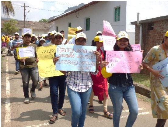
Volunteers held posters and repeated motivating slogans to reach out to the residents.