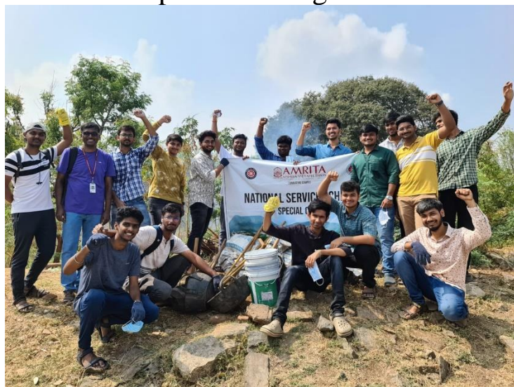
The pond cleaning team

Cleaned up a part of the pond making it free from all kinds of waste and weeds.