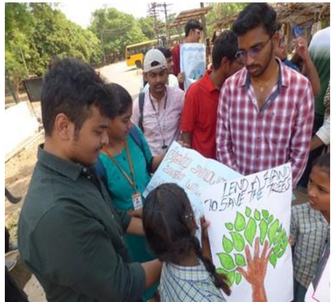
Kids and volunteers during the water conservation awareness rally: A few captures.