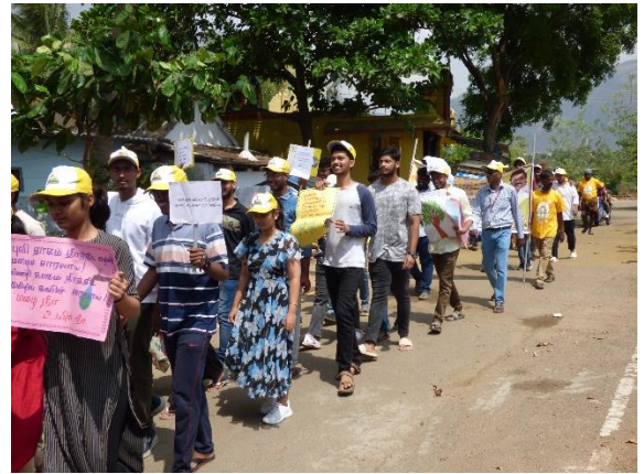
NSS volunteers on a rally to increase the awareness of Swachh Bharat