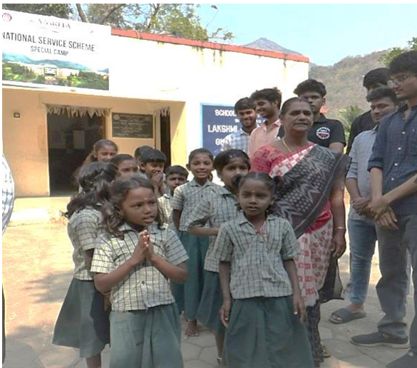
Schoolkids start the day with an auspicious prayer.