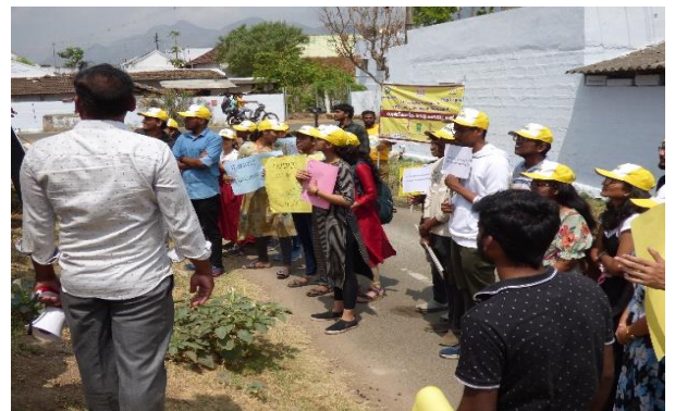
Panchayat Staff and volunteers went hand in hand.