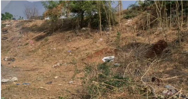
Before the pond cleaning process started

The volunteers also began cleaning the local pond. The group identified the polluted areas of the pond and focused their efforts on cleaning these areas. With dedication and hard work, the volunteers were able to make significant progress in removing the waste and debris that had accumulated in the pond.