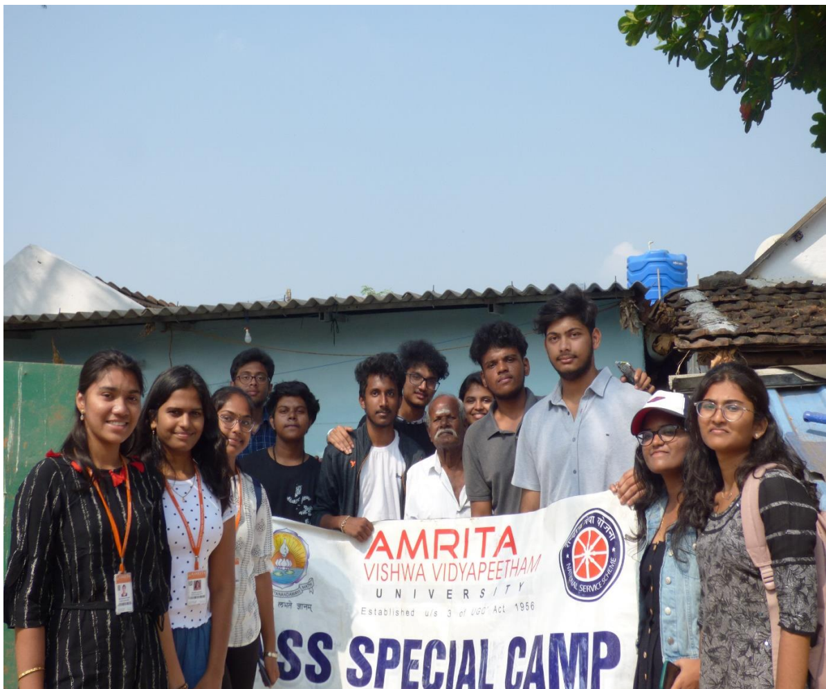
NSS volunteers with the village head.