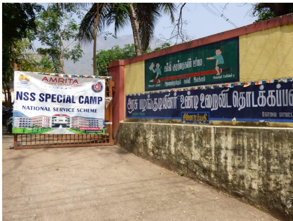
Government Tribal Residential school of Chinnampathy

On Tuesday, March 14, 2023, NSS volunteers visited the Government Tribal Residential school of Chinnampathy village of Coimbatore District.