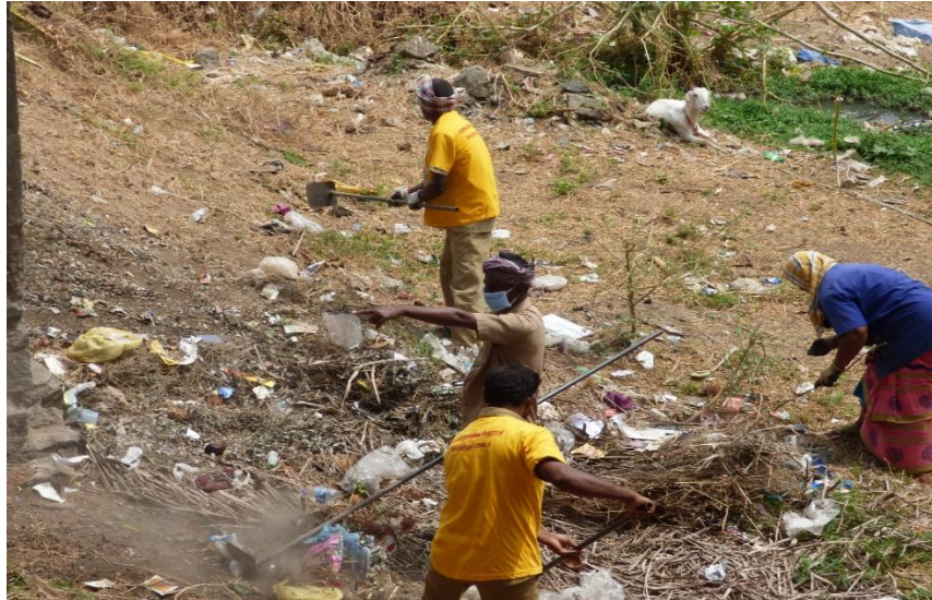
The condition of the pond when the cleaning just began.