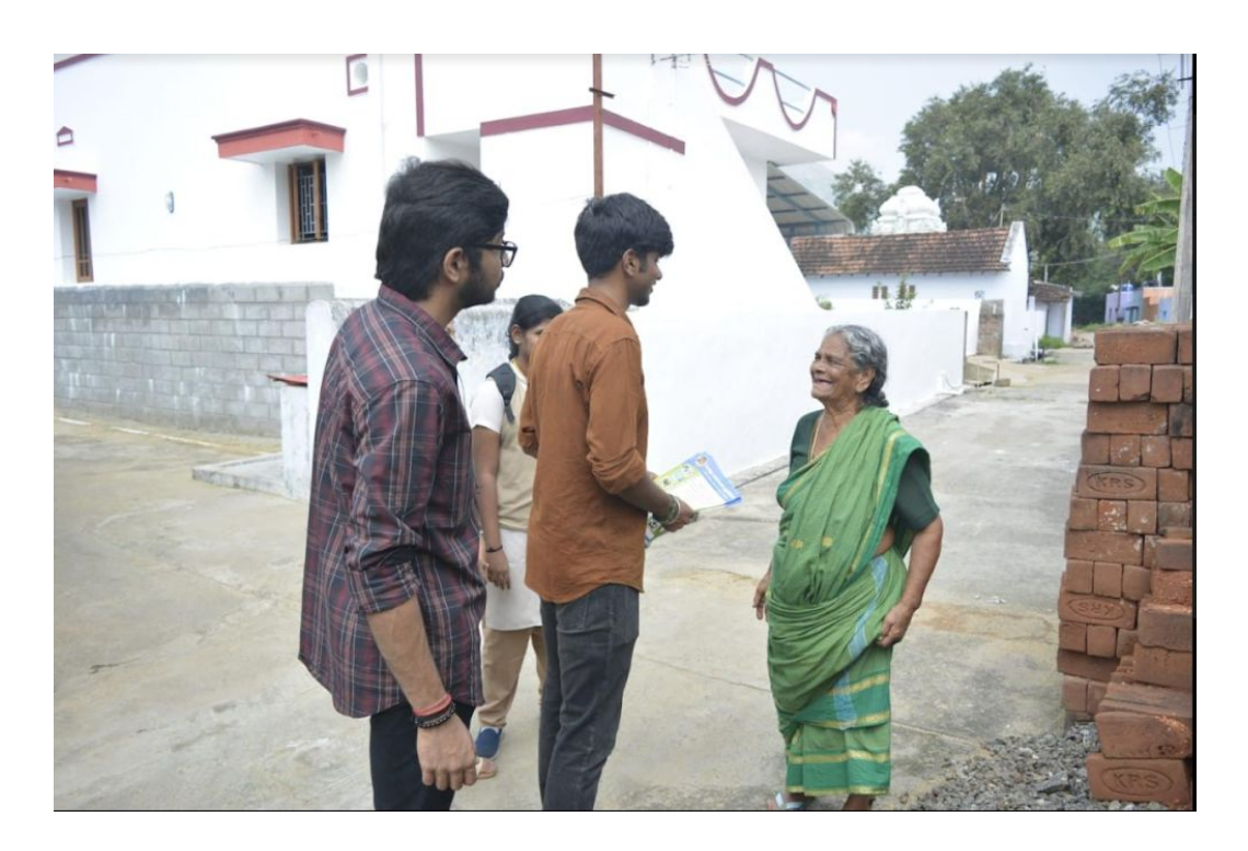
Greeted with a smile - Distributing pamphlets and spreading awareness

A Swach Bharath drive was undertaken by the NSS volunteers of Amrita Viswa Vidhyapeetham. The NSS volunteers cleaned the roads and got rid of Parthenium hysterophorus plants which cause asthma and also other weeds.