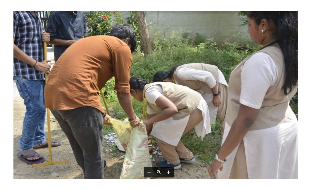
"We don't mind getting our hands dirty , If it means a clean India"- NSS volunteers