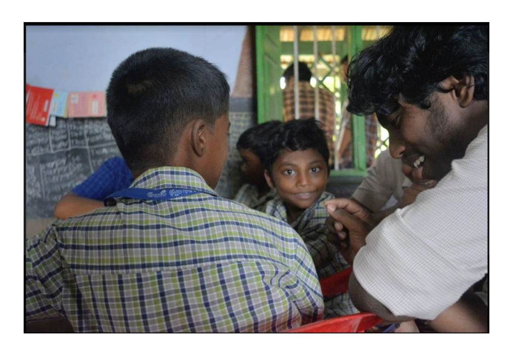
Educating tomorrow's leaders about dengue