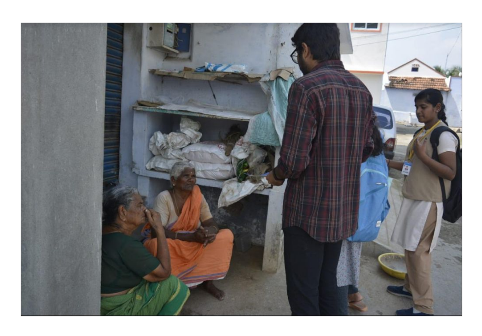
Interacting and spreading awareness about dengue