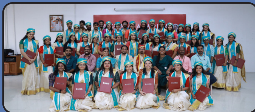
MSW 2022-2024 batch on the day of their convocation