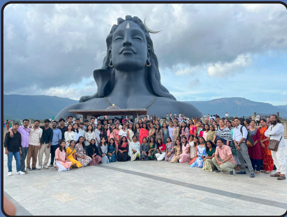
visit to isha yoga centre.