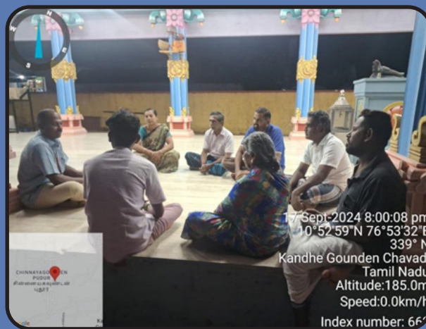
Meeting of Amrita Farmer's Group