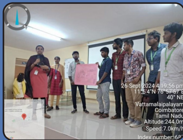
The students presenting in the workshop