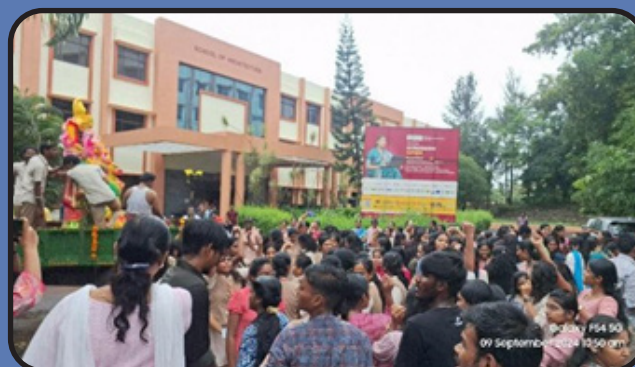
Ganesh Chaturthi Celebration at the campus