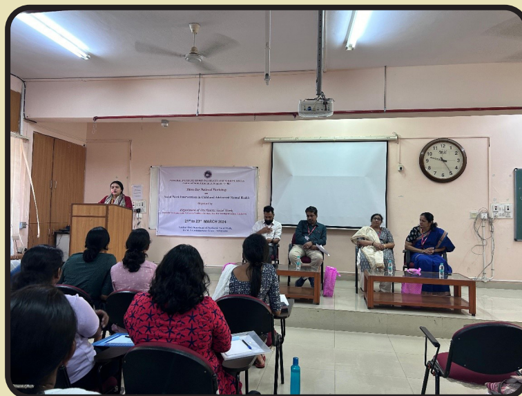
Sessions during the workshop