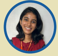
NAVYA E (I MSW)