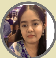
INNISAI ARASI. PON (II MSW)