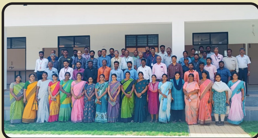
A group photo of the session.