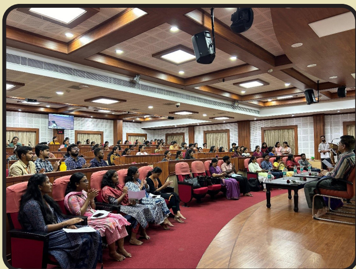
The event at Muralikrishna Hall