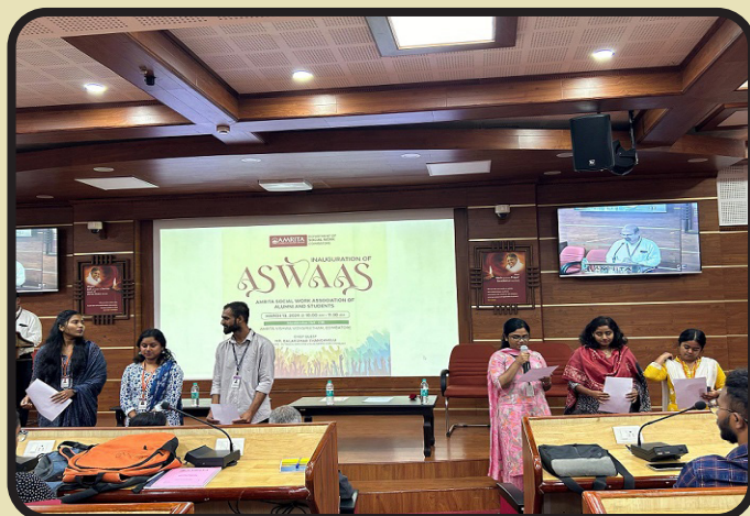
Oath taking ceremony of newly elected representatives.