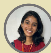
NAVYA E (I MSW)

https://internshala.com/internship/detail/fund-raising-work-from-home-job-internship-at-paw-zz1703575046?utm_source=cp_link&referral=web_share