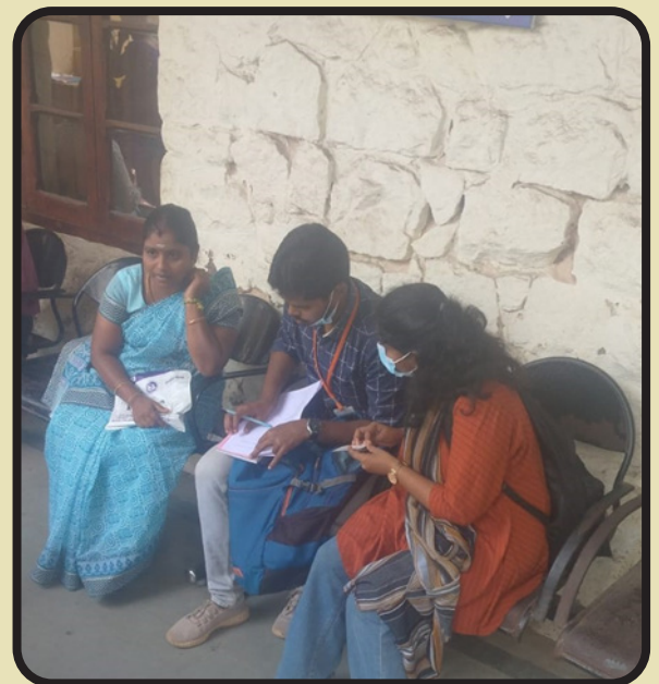
Students proceeding with the necessary requirements for the disability certificate.