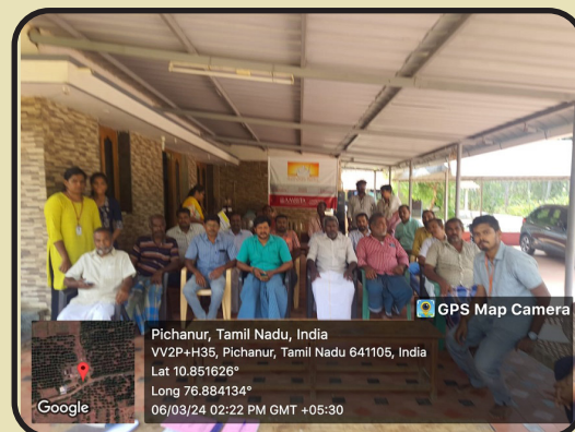
UBA capacity building training program group.