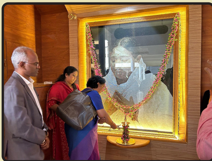
Lighting the lamp for the event by the chief guests