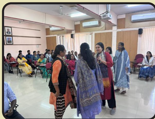
Various activities during the workshop