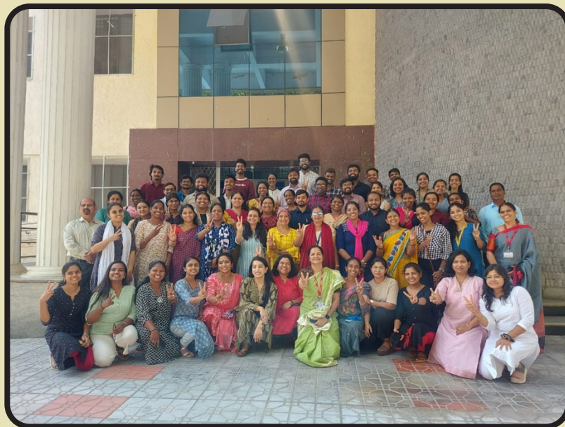
Group photo of participants at the workshop