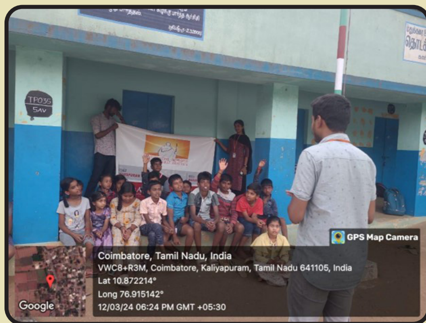
Second year MSW conducting awareness programme among children

On 12th March 2024, as a part of Unnat Bharat Abhiyan (UBA), Amrita Vishwa Vidyapeetham, Coimbatore (U-0436) conducted an awareness program among the children in the Kaliyapuram village of Coimbatore district. Students from second year MSW organized and conducted an awareness session among the children on the topic of "Ill effects mobile phone addiction" in the village. During the awareness, it was shocking to discover the rate of addiction among children at Kaliyapuram village.