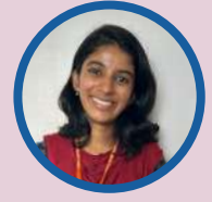
NAVYA E (I MSW)