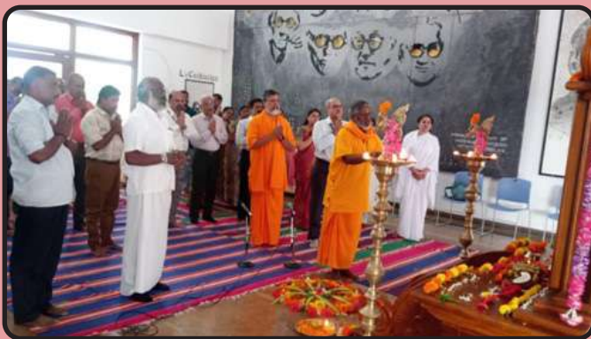
Inaugural function of School of Social and Behavioural Sciences at Amrita Agricultural campus, Arasampalayam

The inaugural program of the Amrita School of Social Sciences at the Arasampalayam campus was a grand success with the presence of major dignitaries at the campus. The event marked the beginning of a new era in social sciences education at Amrita Vishwa Vidyapeetham. The school is committed to producing socially responsible and compassionate professionals who can make a positive impact on society.