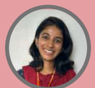
NAVYA E (I MSW)

ANSWER : 1)C, 2) C, 3)D, 4)A, 5)A, 6)A, 7)B, 8)A, 9) B, 10)B