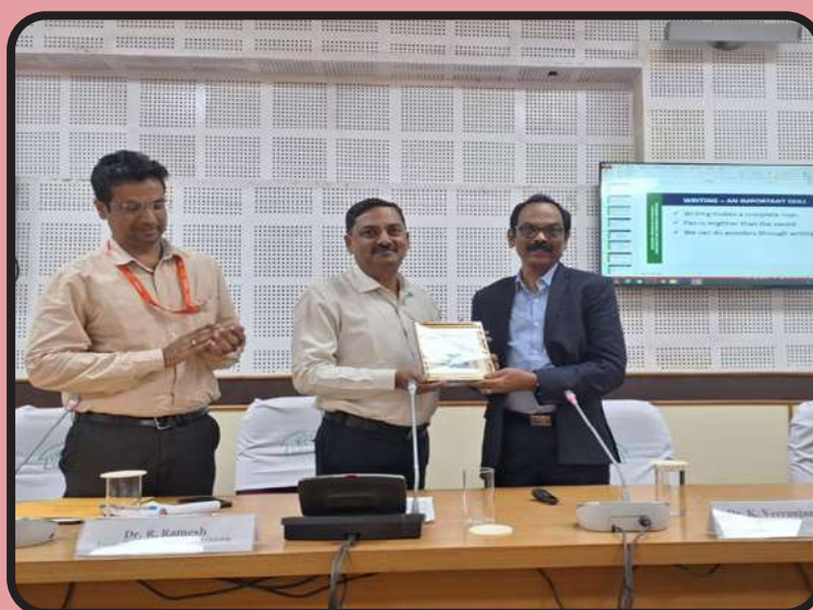
Glimpses of the training programme