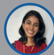
NAVYA E (I MSW)