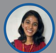
NAVYA E (I MSW)

https://internshala.com/internship/detail/fundraising-work-from-home-job-internship-at-pawzz1703575046?utm_source=cp_link&referral=web_share