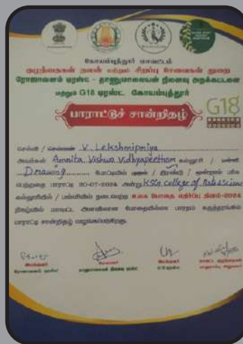
Certificates received by the students