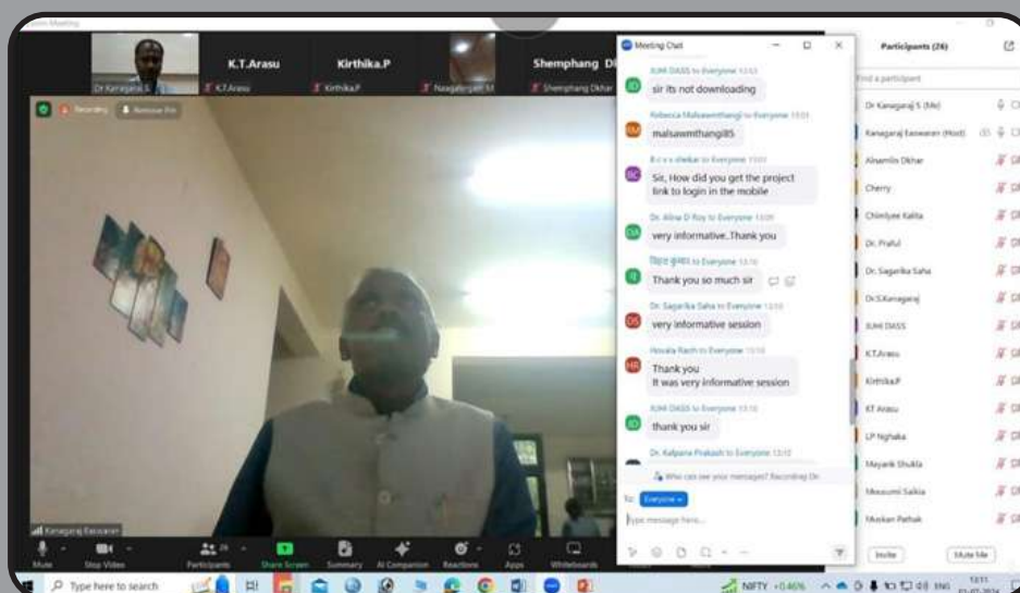
Glimpses of the session conducted online