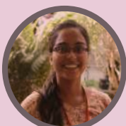
ATHIRAT N ( II MSW )