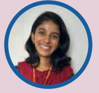
NAVYA E (I MSW)