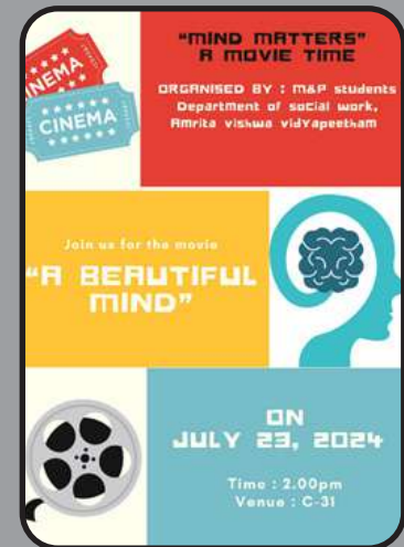
Poster of the event

On July 23, the Medical and Psychiatric Social Work students at Amrita Vishwa Vidyapeetham, Arasampalayam, organized the screening of the movie "A Beautiful Mind" in the class at 2 pm. The event was attended by second year MSW students, faculty members, and PhD scholars. Directed by Ron Howard and featuring Russell Crowe, the film portrays the life of John Forbes Nash Jr., a Nobel laureate in Economic Sciences, focusing on his groundbreaking work in game theory and his struggle with schizophrenia. The event aimed to raise awareness about schizophrenia, highlighting the realities of living with this mental illness. The post-screening discussion on the movie emphasized the impact of medication, the importance of societal support, and the role of mental health professionals.