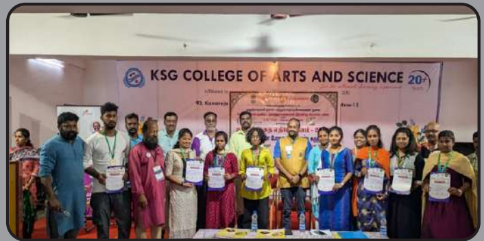
Students participating in Drug Free India campaign