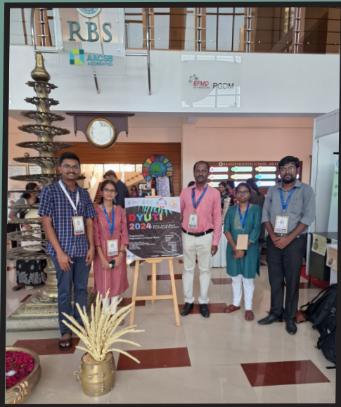
Faculty members, PhD scholars and IIInd year MSW students at the conference venue.