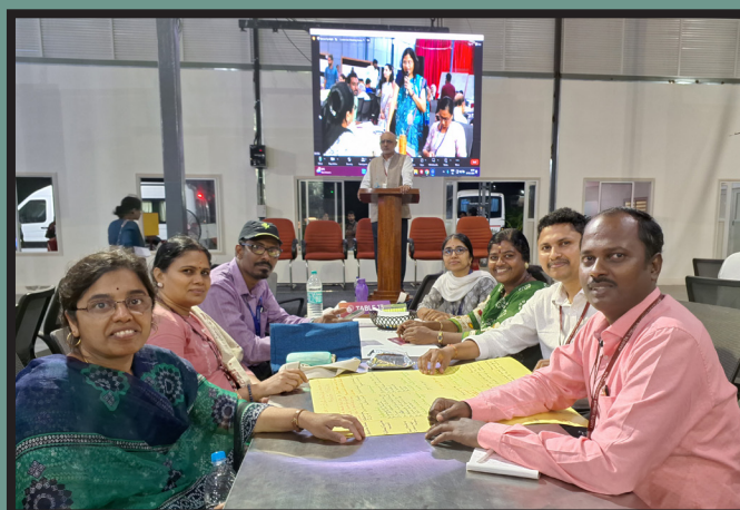
Social Work Faculty with other discipline for grand challenge workshop