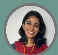
NAVYA E (I MSW)

https://internshala.com/internship/detail/fundraising-work-from-home-job-internship-at-pawzz1703575046?utm_source=cp_link&referral=web_share