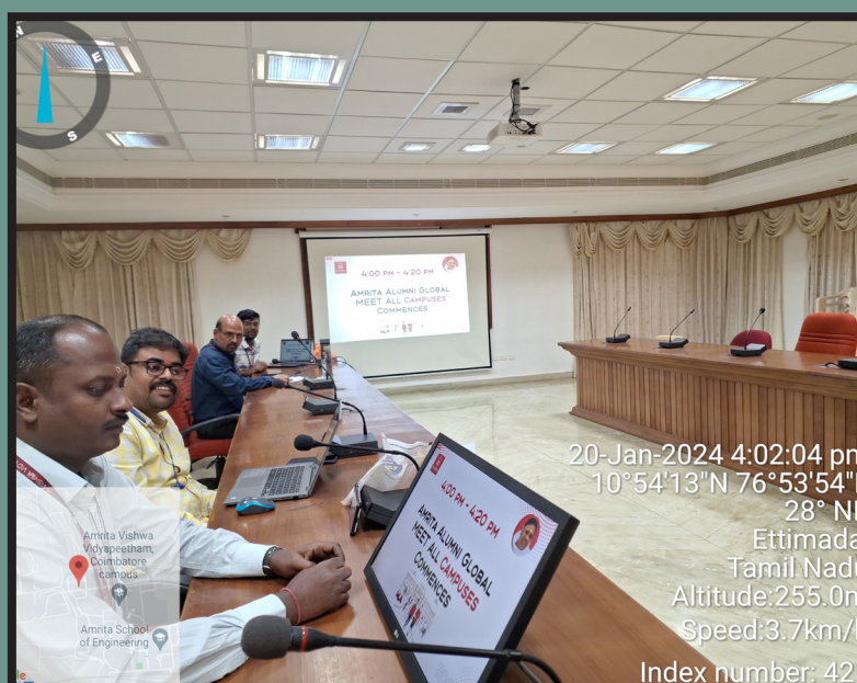
Participating in global alumni meet online