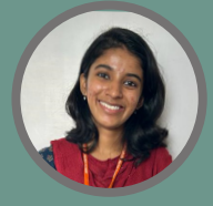
NAVYA E (I MSW)