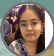
INNISAI ARASI. PON (II MSW)