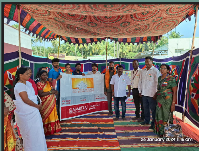
MSW students participating in Grama sabha