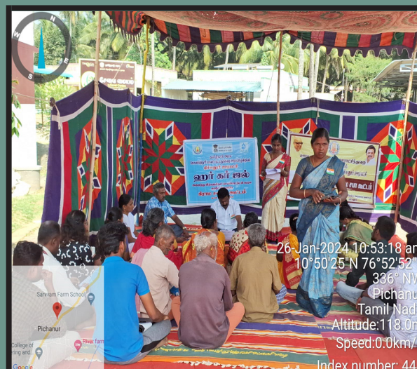
Gramasabha being held at Pichanur Grama panchayat