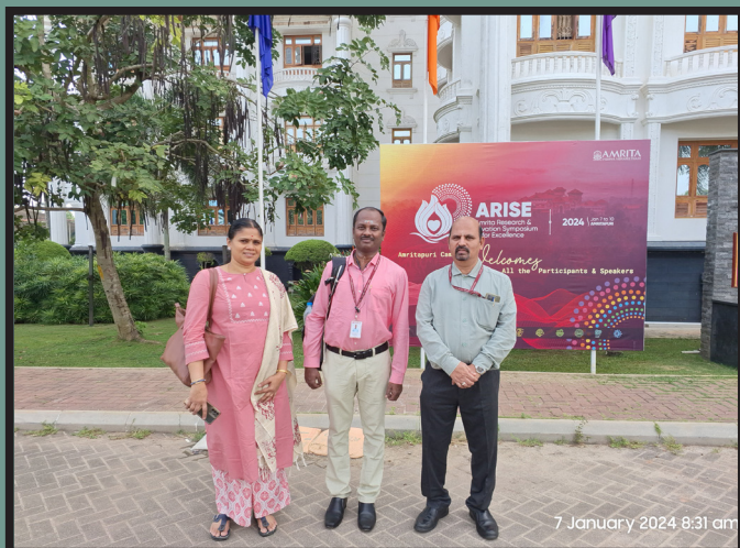
Social Work Faculty members at ARISE