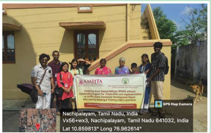
Nachipalayam, Tamil Nadu, India Vx56+wx3, Nachipalayam, Tamil Nadu 641032, India Lat 10.859813° Long 76.962614°