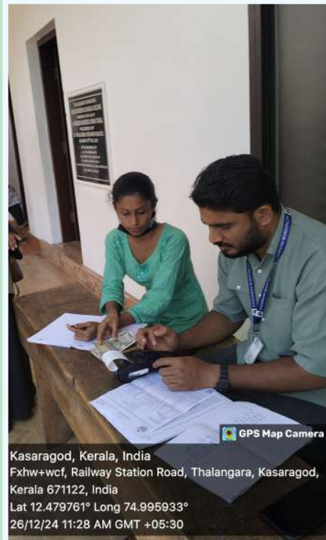
Kasaragod, Kerala, India Fxhw+wcf, Railway Station Road, Thalangara, Kasaragod, Kerala 671122, India Lat 12.479761° Long 74.995933° 26/12/24 11:28 AM GMT +05:30