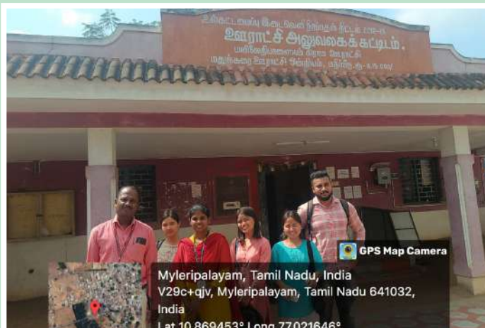
Myleripalayam, Tamil Nadu, India V29c+qjv, Myleripalayam, Tamil Nadu 641032, India Lat 10.869453° Long 77.021646°