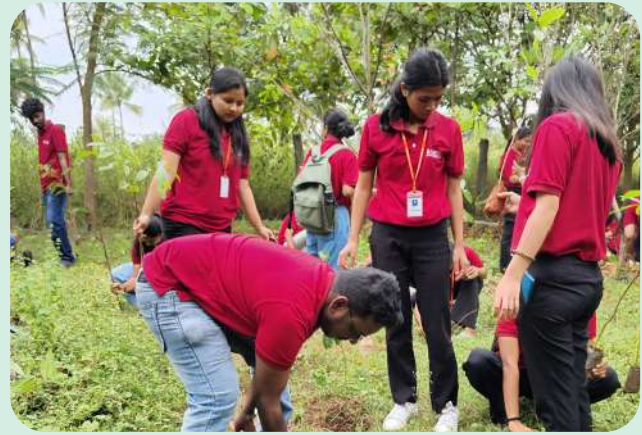
Students planting saplings.