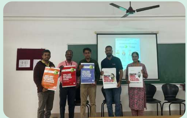
Orientation on Gandhi fellowship