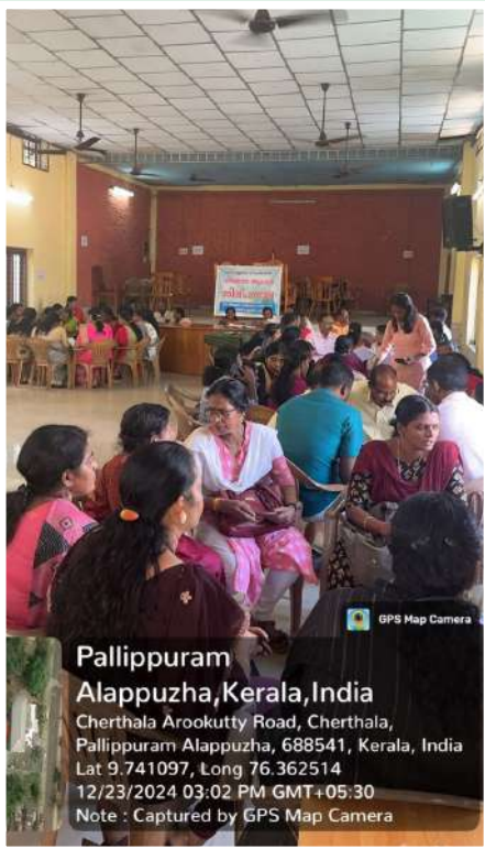
Pallippuram Alappuzha, Kerala, India Cherthala Arookutty Road, Cherthala, Pallippuram Alappuzha, 688541, Kerala, India Lat 9.741097, Long 76.362514 12/23/2024 03:02 PM GMT+05:30 Note : Captured by GPS Map Camera