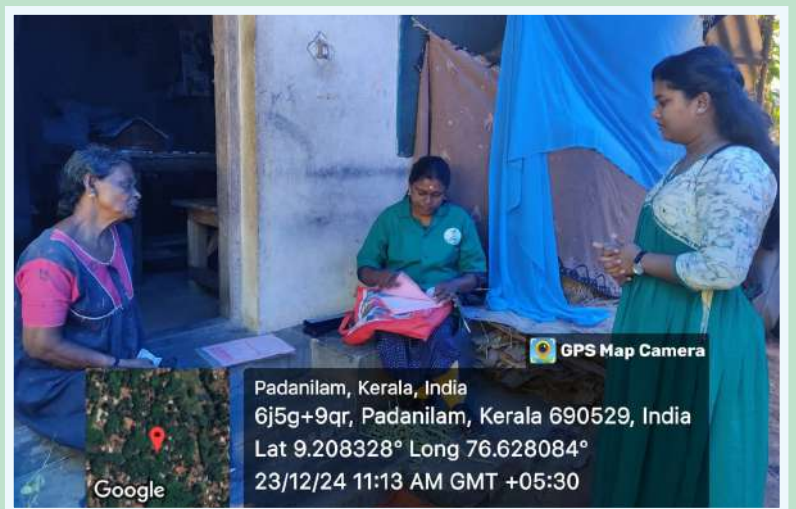
Padanilam, Kerala, India 6j5g+9qr, Padanilam, Kerala 690529, India Lat 9.208328° Long 76.628084° 23/12/24 11:13 AM GMT +05:30