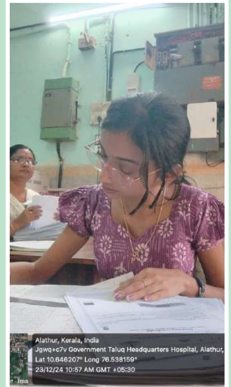
Alathur, Kerala, India Jgww+c7v Government Taluq Headquarters Hospital, Alathur, Lat 10.646207° Long 76.538159° 23/12/24 10:57 AM GMT +05:30