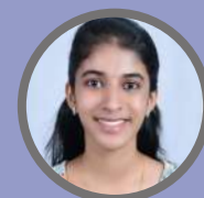
NAVYA E (I MSW)