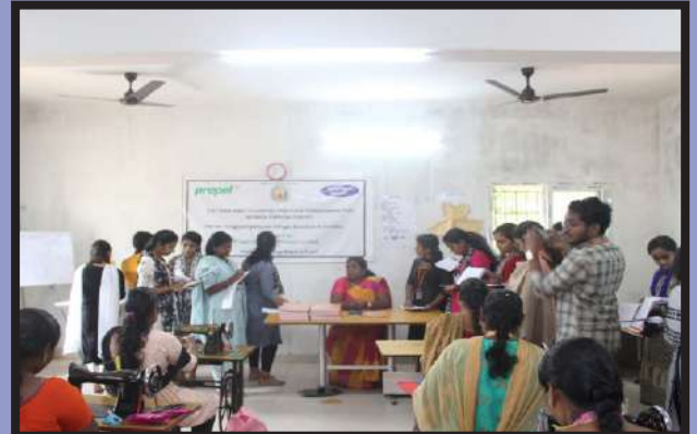
I MSW students attending orientation at CCF, WESTRIC, Don Bosco Anbu Illam and COODU