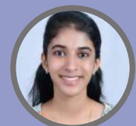
NAVYA E (I MSW)

https://internshala.com/internship/detail/fundraising-work-from-home-job-internship-at-srestham-education-trust1696412565