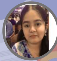
INNISAI ARASI. PON ( II MSW )