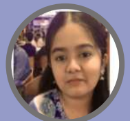
INNISAI ARASI. PON (II MSW)

This program will establish specific criteria and benchmarks for each of these green credit activities.