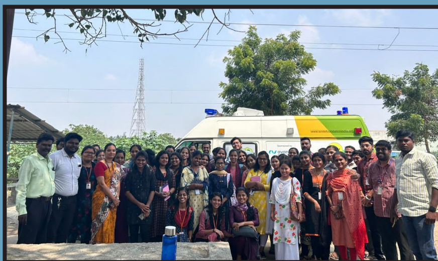
I MSW students at Smile Foundation for orientation visit