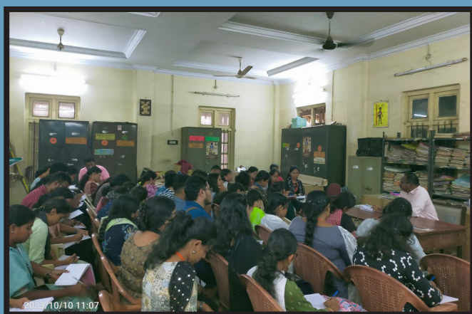
I MSW students at NCLP for orientation visit