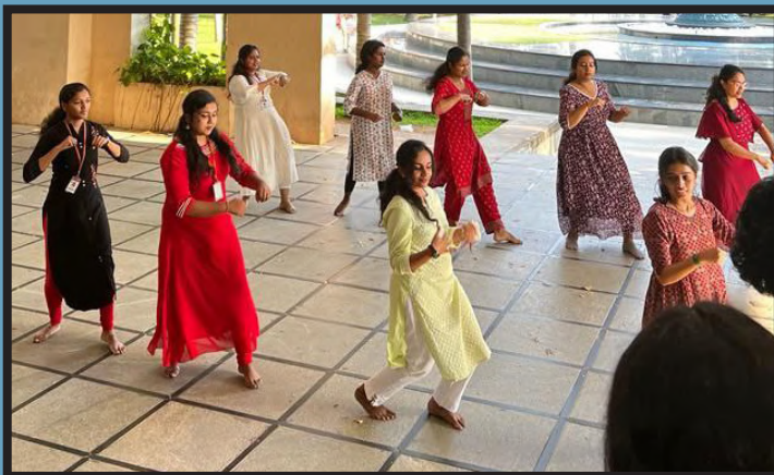
MSW students performing flash mob

On October 13, 2023, the Department of Social Work at Amrita Vishwa Vidyapeetham, Coimbatore conducted a programme in honor of World Mental Health Day. The programme was conducted in front of Academic Block II. A flash mob and skit were the show's opening acts. The theme of the day was "Mental health is a universal human right," which served as the inspiration for all the people. Through the skit, the students depicted how mentally ill people are being viciously treated and how they are seen in our society. They depicted that there is still much work to be done to ensure that those with mental illness receive the respect, dignity, and care they deserve. Also, the Department of Social Work organized a best quote competition.