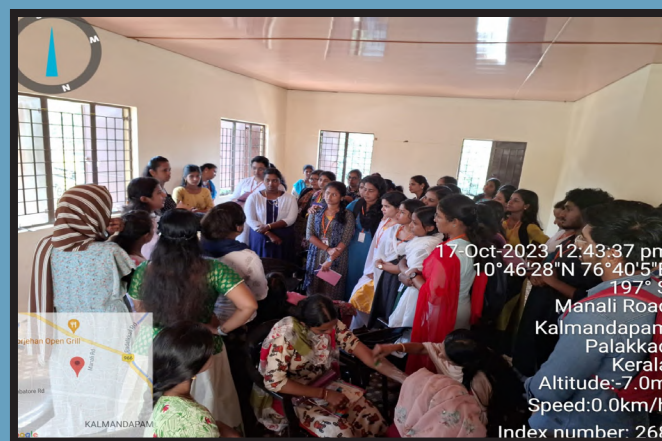
I MSW students at JSS for orientation visit