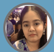
INNISAI ARASI. PON (II MSW)

If someone violates this Act and there is no specific punishment outlined, they may be fined up to five lakh rupees, but the minimum amount is only five thousand rupees. The fine may also be increased to fifty thousand rupees for each day that the default continues after the first day.