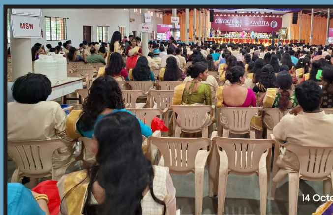
MSW students 2021-2023 attending convocation