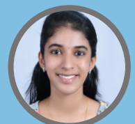
NAVYA E (I MSW)

https://internshala.com/internship/detail/social-entrepreneurship-work-from-home-job-internship-at-hamari-pahchan-ngo1697527853