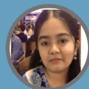
INNISAI ARASI. PON (II MSW)