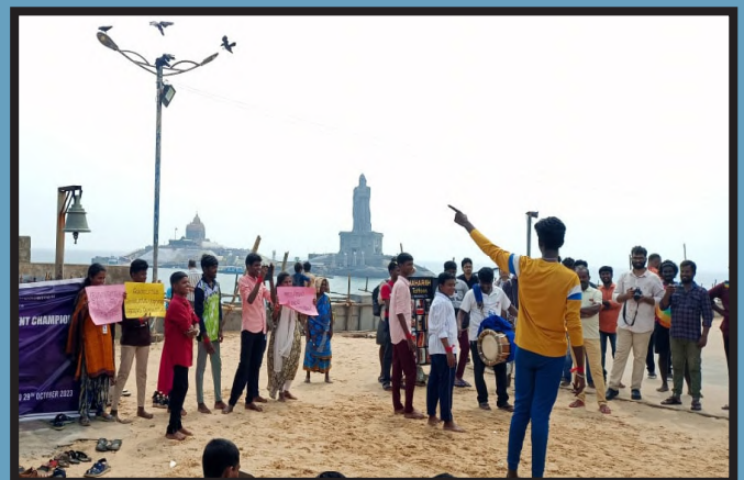
Community outreach activity performance by the students of adolescent champion programme.