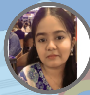
INNISAI ARASI. PON ( II MSW )