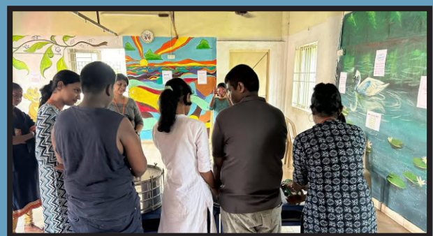
Activities done by II MSW students at Shivesh Autism Centre, Coimbatore