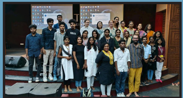
The speaker with students of Amritapuri campus