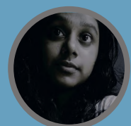
ANAGHAT B (I MSW)