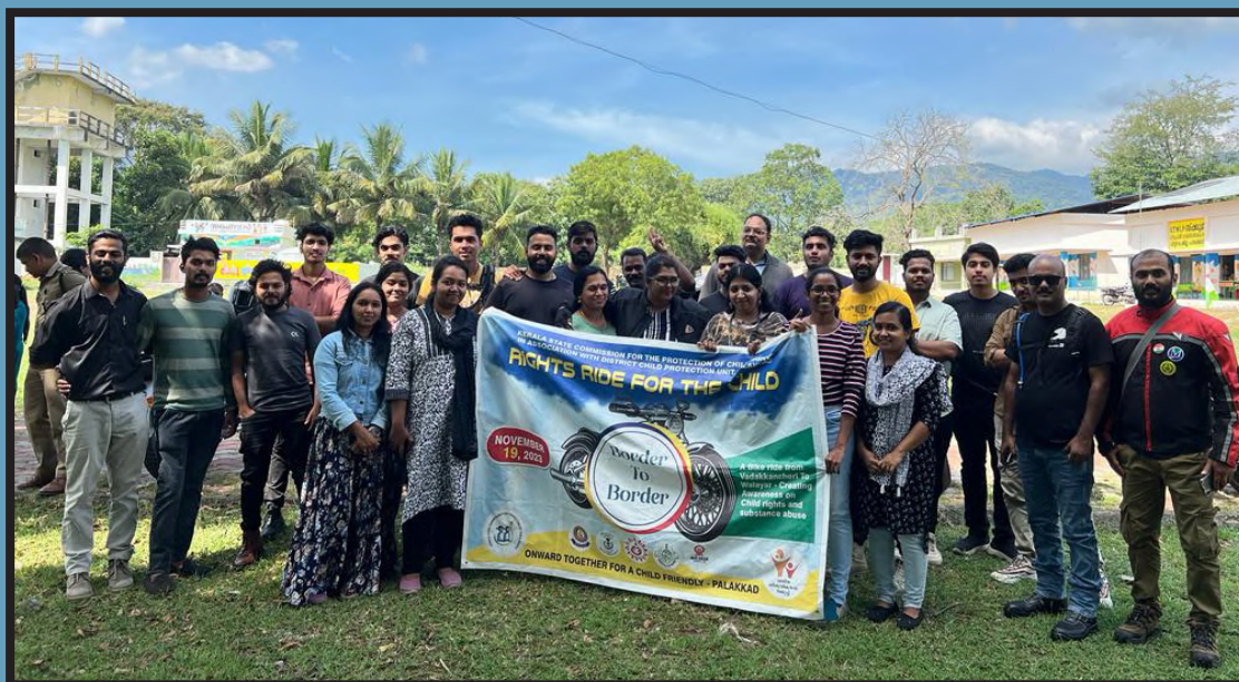
An initiative to the Rights Ride For The Child, Palakkad.