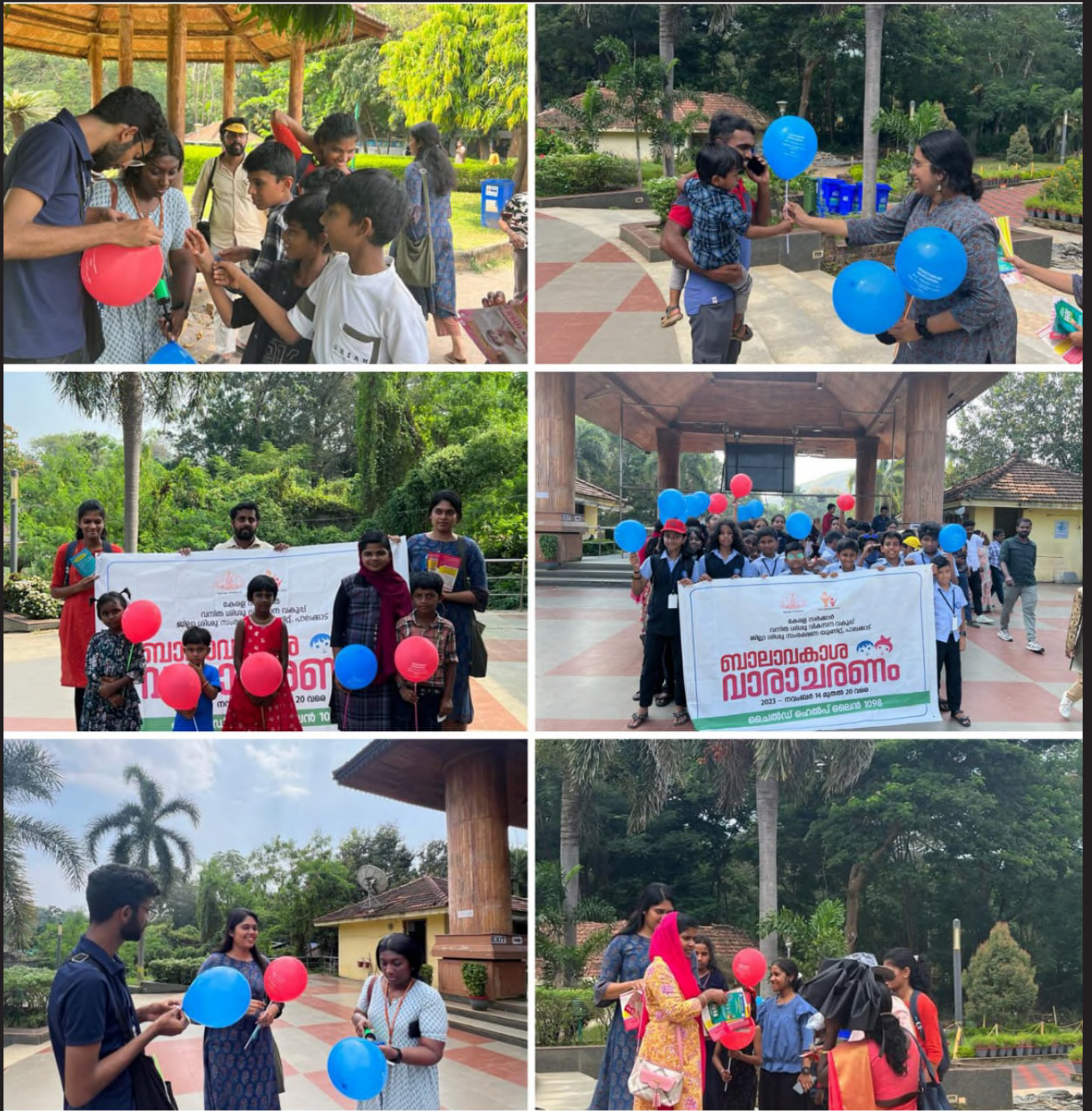
Outreach activity at Malampuzha Garden, Palakkad