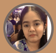
INNISAI ARASI. PON (II MSW)