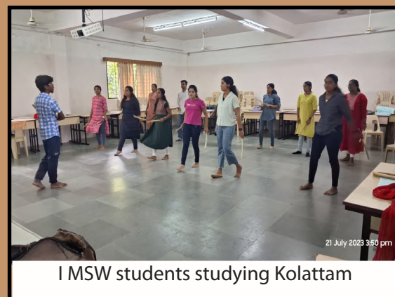
I MSW students studying Kolattam