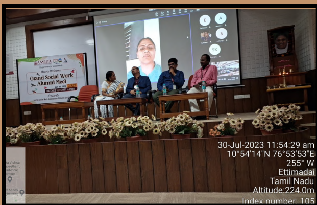
Dignitaries on the stage