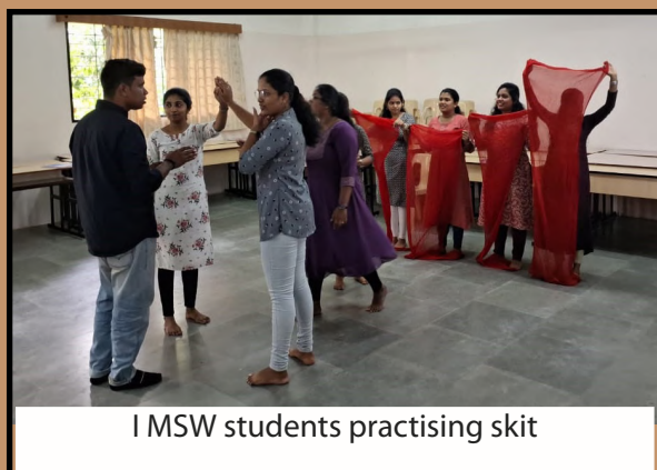
I MSW students practising skit