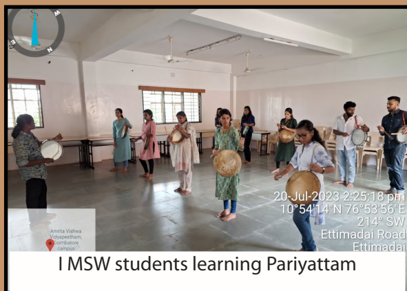
I MSW students learning Paraiyattam