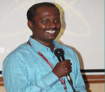
FACULTY CHIEF EDITOR