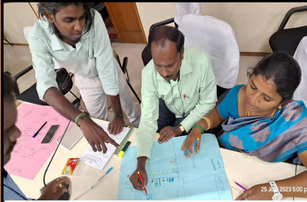
Group activities during the session