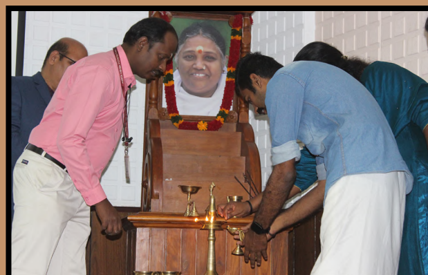
Dignitaries on the dice lighting the lamp