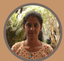
VINAYA VM (II MSW)