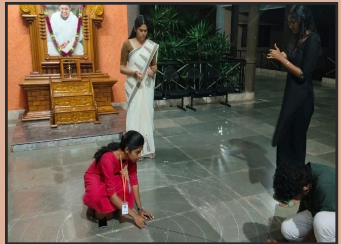
Previous day preparations of Pookalam