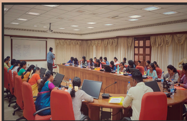
School Mental Health Programme organised by Department of Social work