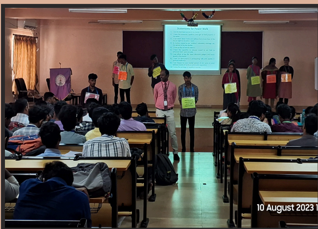
10 August 2023