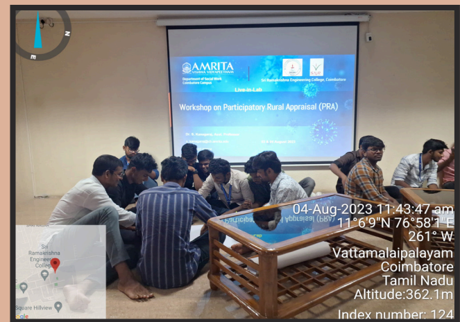
04-Aug-2023 11:43:47 am 11°6'9"N 76°58'1"E 261° W Vattamalaipalayam Coimbatore Tamil Nadu Altitude:362.1m Index number: 124