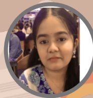
INNISAI ARASI. PON (II MSW)