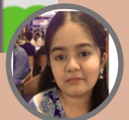
INNISAI ARASI. PON (II MSW)