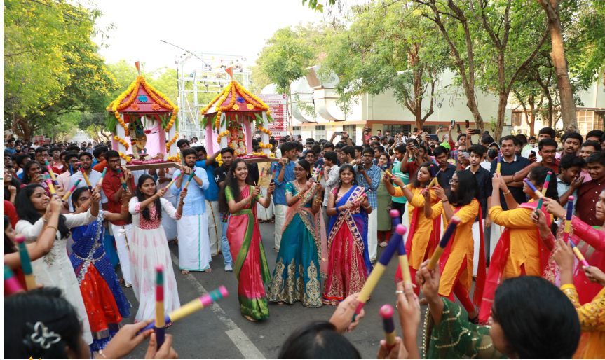
Ugadi celebration in the campus

But that wasn't all; upon discovering my Andhra 'food lineage', my life partner went to great lengths to prepare authentic Andhra delicacies for me. And she prepared everything from Vangi bath to Avakkai Achar to Pappu podi, all of which had a genuine Andhra flavour in them, thanks to her.