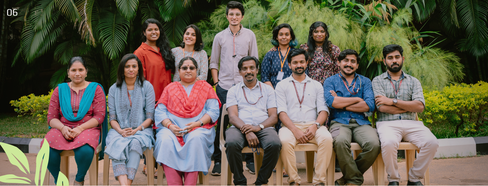
2020 MA Mass Communication batch with Faculty and Staffs