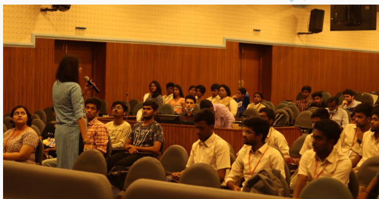
Amrita talkies film club meeting held on 6 April 2022 at Amriteswari hall.