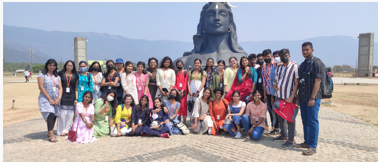
Field Visit : Students of Mass Communication during the field visit to Isha yoga foundation as part of Deeksharambh 2022, student induction program.

Moreover, a surreal experience it was very cinematic. All the students were amazing on the stage. The crowd was electrifying. The confidence level of the performers and how they presented it was inspiring. I thoroughly enjoyed the show.