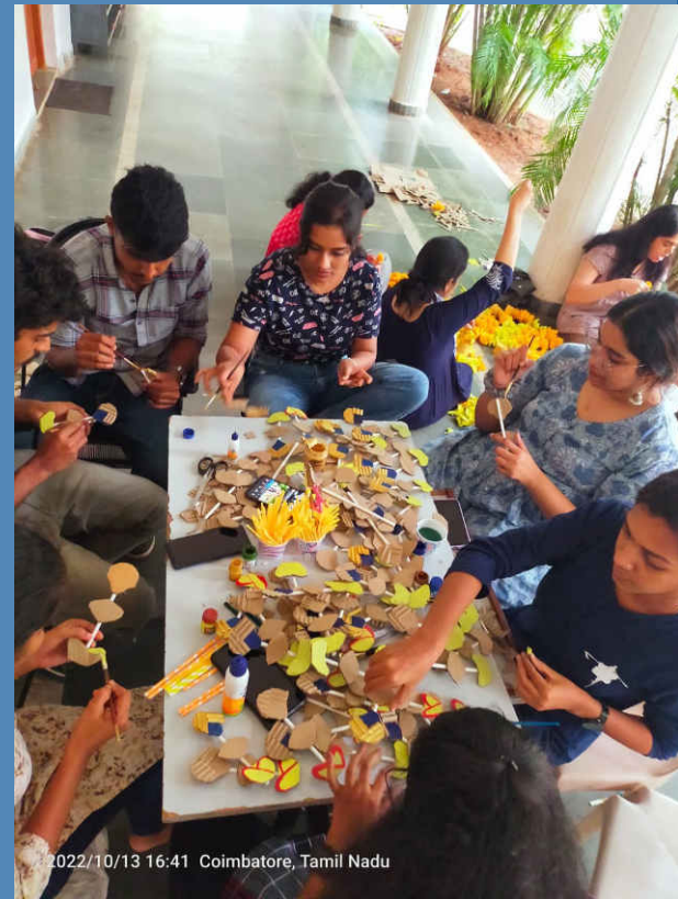
2022/10/13 16:41 Coimbatore, Tamil Nadu

The 18th October which was the seventh day of the fiesta, started with Nagarasankeerathanam. The grandeur of the floats that narrated the story of Lord Krishna along with the embellishment of the campus using all decorative pieces that sang of the magnificence of Krishna metamorphosed the campus into real Vrindavan.