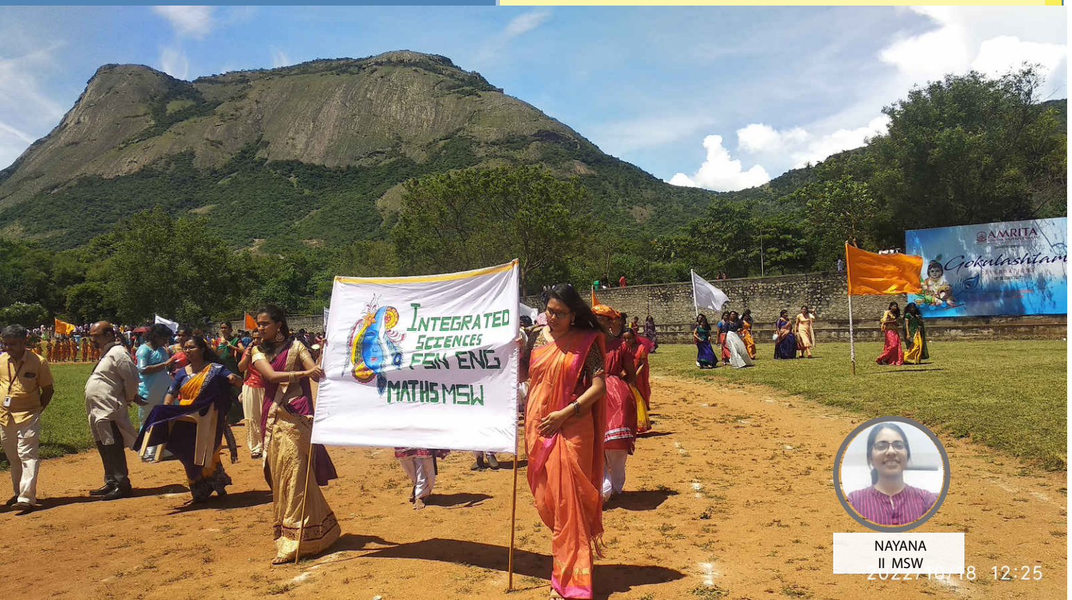
NAYANA II MSW