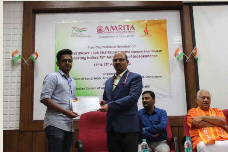
Distribution of certificate