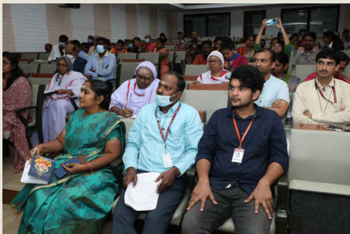
Audience of the National Seminar

Feedback: It was time for the participants to give