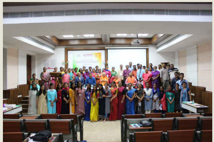
Group Photo of the valedictory