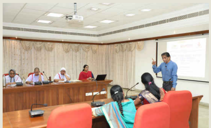
Presentation session of papers in Tamil