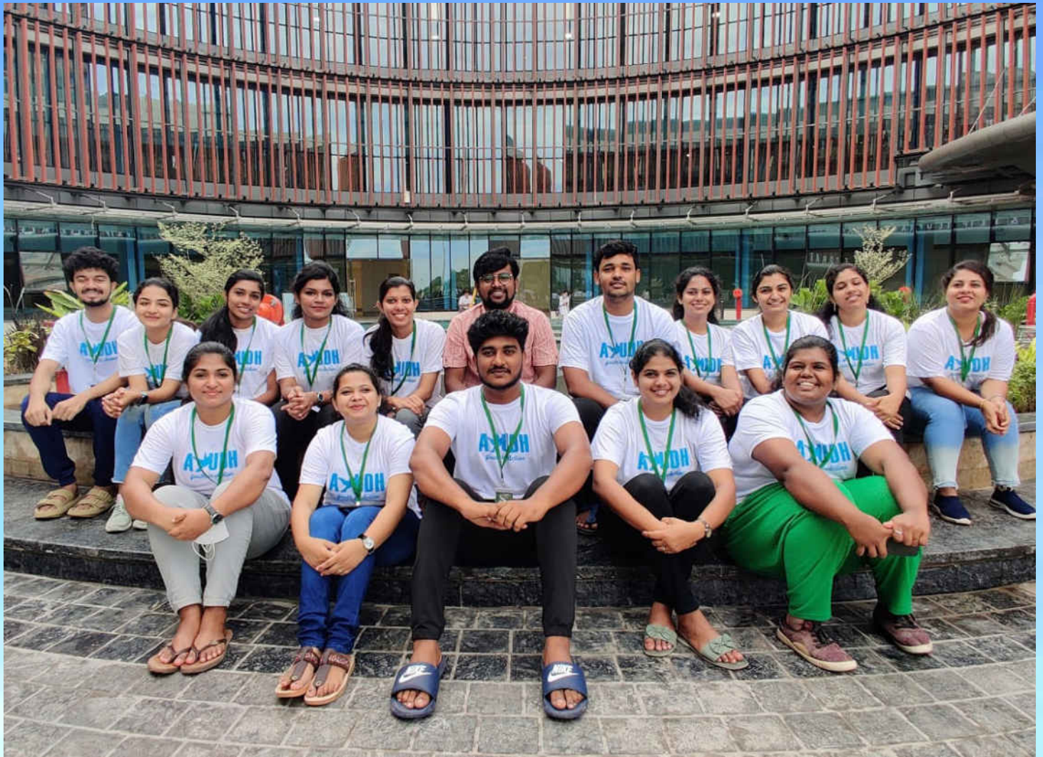
MSW students at Amrita Hospital, Faridhabad