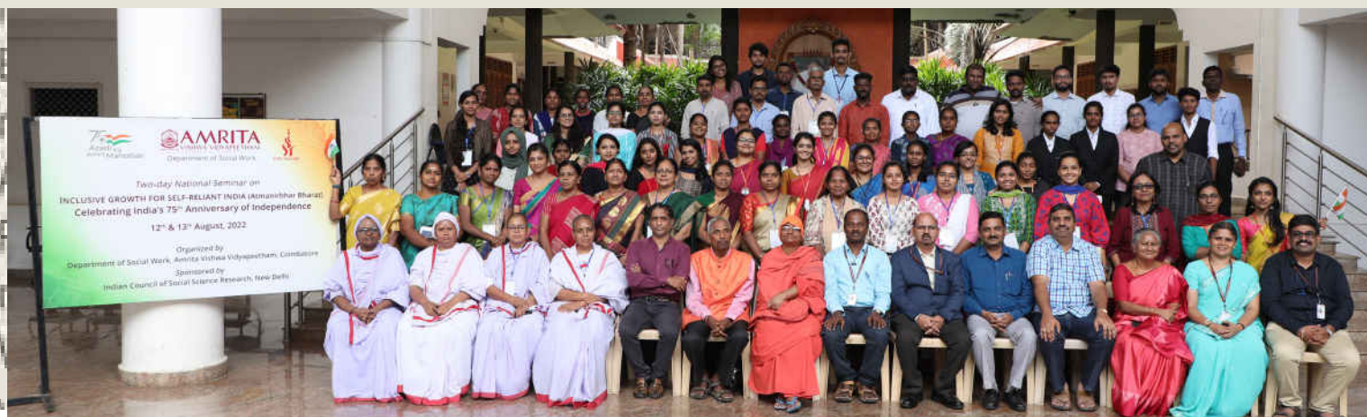
Group Photo of the introductory session