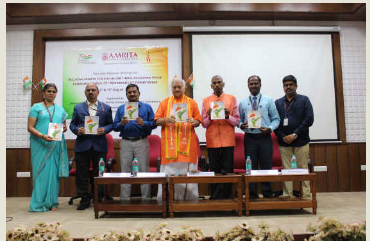
Book release by the chief guest