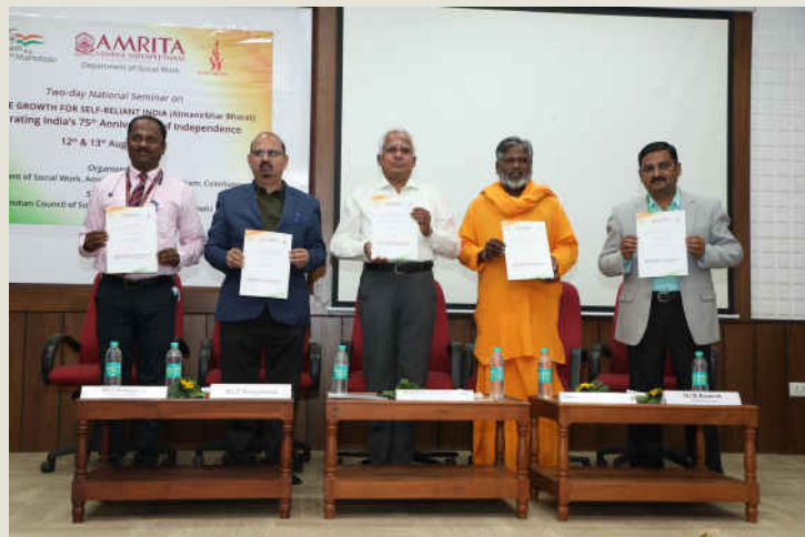
Publishing of book of abstracts