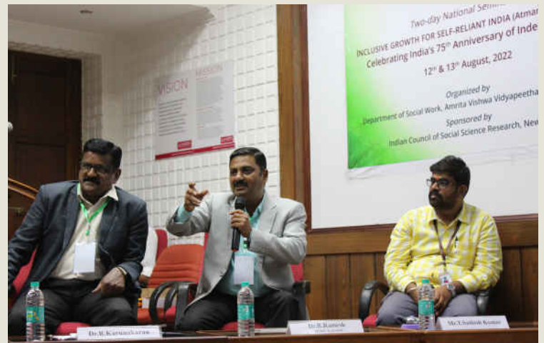
Picture from Session I