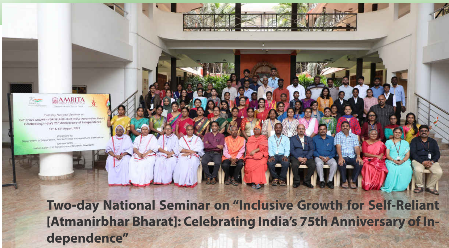
Two-day National Seminar on “Inclusive Growth for Self-Reliant [Atmanirbhar Bharat]: Celebrating India’s 75th Anniversary of Independence”