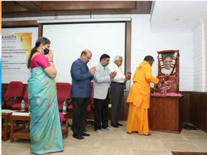
Lighting of the lamp at the inaugural session

A two-day National Seminar sponsored by ICSSR was conducted by the Department of Social Work of Amrita Vishwa Vidyapeetham, Coimbatore. The beginning of the event was heralded by a grand inauguration ceremony. It was conducted on the 12th and 13th of August, 2022