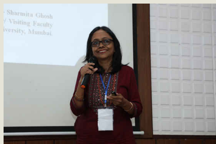
Presentation session of papers in English

A total of six sessions on different topics were organised.