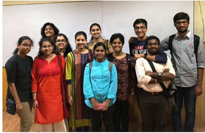
Picture of members who attended Emergence 2019, conducted on 3rd February 2019.