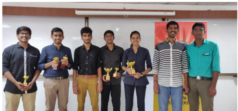
Poster and a picture of the Humorous Speech and Evaluation Contest conducted on 2nd October 2018.