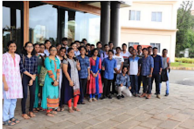
Poster and a picture of the Joint Meeting conducted on 15th August 2018