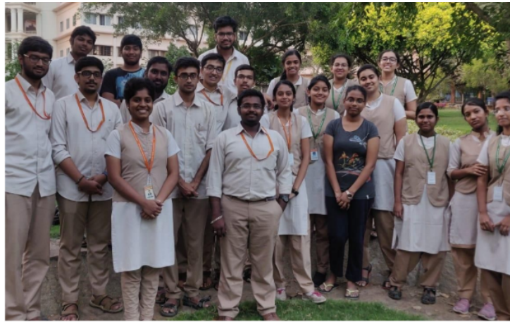
Picture of the Outdoor Meeting conducted on 4th February 2019.