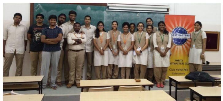
Poster and a picture of the Prepared Speech Marathon conducted on 3rd January 2019.