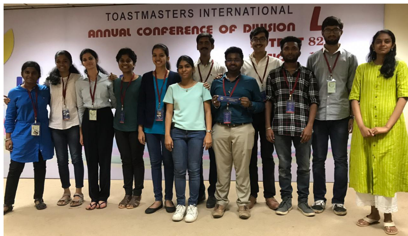
A group photo clicked on the day of Luminance 2019, 24th March 2019.