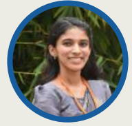
NAVYA E (II MSW)