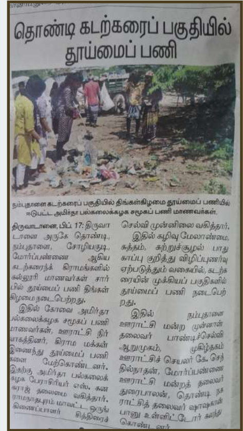
Newspaper report on CLEAN UP DRIVE

The fieldwork program in Rameshwaram was a valuable learning experience, allowing students to interact directly with communities, understand their challenges, and contribute meaningfully. Despite minor setbacks in completing case work and group work, the overall objectives were successfully met, providing a strong foundation for future community-based initiatives. The fieldwork served as a great opportunity for experiential learning and practical engagement in social work methodologies.